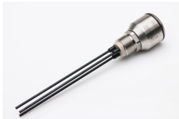
Topview SKS 35